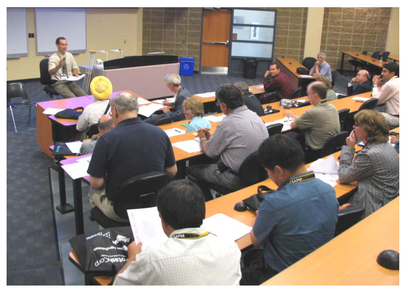
Gueph 09: CSA Annual Meeting, August 5-7, 2009